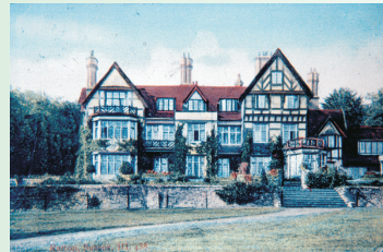
Ratton House as it was in about 1906. Built in the 1890s in mock Elizabethan style it was formerly home to Lord and Lady Willingdon.