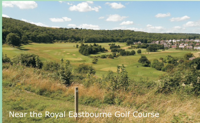
Near the Royal Eastbourne Golf Course

Section 4/ Pashley / Warren Hill. TV 588 990 to TV 592 979 Here the Jubilee Way provides panoramic views from a woodland edge and from open meadows above Paradise Plantation. Most of the woodland here is self-generated sycamore and ash. Just south of the A259 East Dean Road the path curves gently around a wooded valley and the Royal Eastbourne Golf Course opens out to the east with views extending east to Hastings. The golf course was founded in 1887 the same year in which Queen Victoria granted permission for the 'Royal' prefix. On the spur south of the golf course, a set of mountain bike trails will be seen on the steep wooded hillside below the path. Where the path rounds the prominent spur and traverses a small meadow area the South Downs Way crosses. A very short detour up the hill here brings you to a larger open meadow where the sparse flint-walled remains of an horizontal windmill can be seen (TV 591 983). Built in 1752, the wind driven mechanism unusually consisted of sails set around a vertical driveshaft. On the south of this spur the path crosses a meadow near the back of the houses and an alleyway, marking the south end of this section, runs between the houses to Upper Carlisle Road.